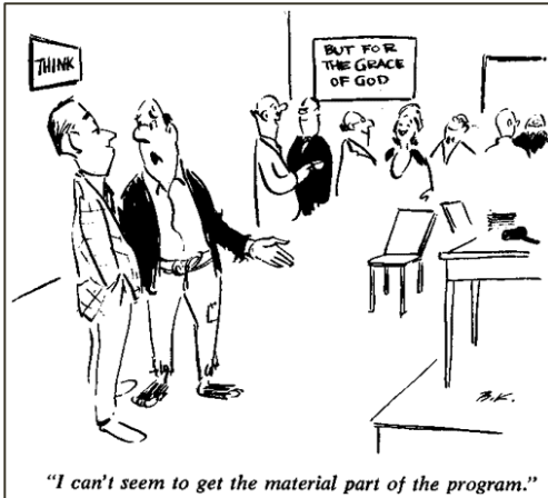
Grapevine Magazine August 1962