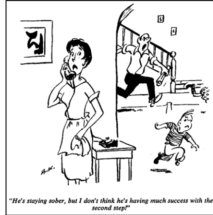
Grapevine Magazine September 1962