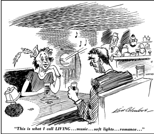
Grapevine Magazine July 1947